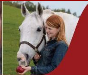
promoting health & performance