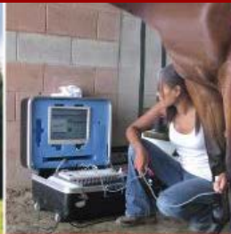
funding industry research